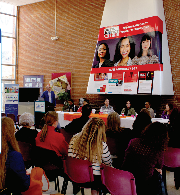
The WCA Poverty Pulse Dashboard was unveiled in front of audience of community partners and decision-makers on December 9, 2025.