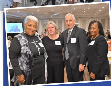
THE COMMISSIONERS' CONVERSATION