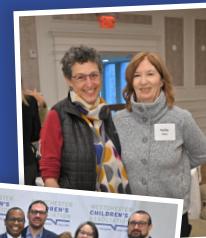
2023 ADVOCACY BREAKFAST