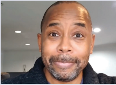
Hollywood actor and longtime friend and supporter to WCA, Michael Boatman , kicks off the evening