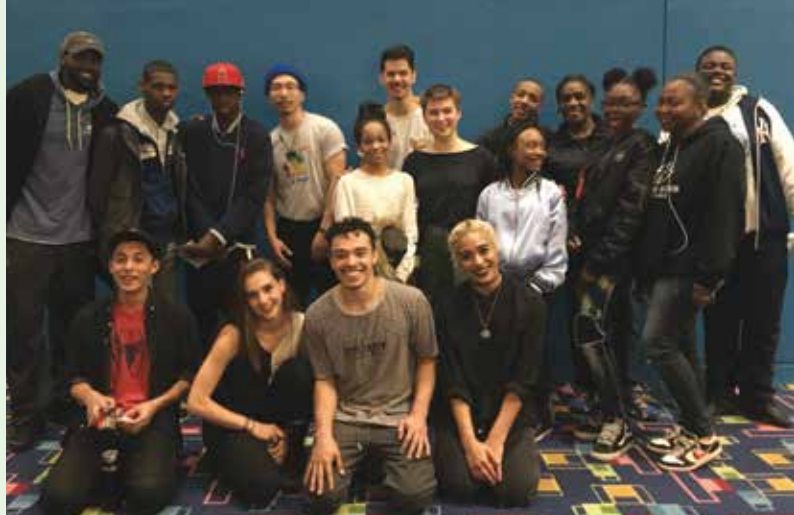
Some of the young people that attended this year's Take the Kids to a Show event at Purchase Performing Arts Center.

This year, we invited kids to watch the RUBBERBANDance Group, a risk-taking, innovative hip-hop ballet group. Experiencing a performance like this at a young age inspires creativity and dreams for the future. The young